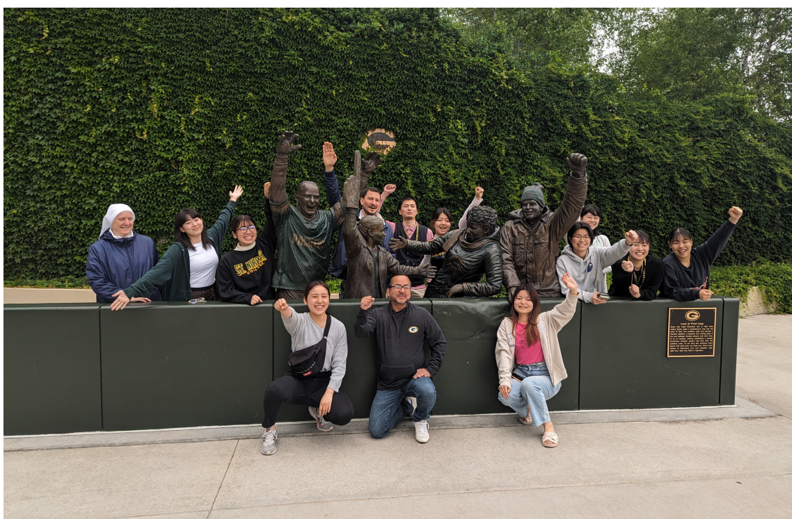
Caption: Summer ESL students pose by the Lambeau Leap statue on a class field trip.

With the weather heating up, so are classes as the summer ESL program is well under way. Our ESL students have an incredible drive to learn the English language through meaningful immersion here at SNC. Throughout the summer there have been many wonderful experiences to embrace the American culture and make new memories.