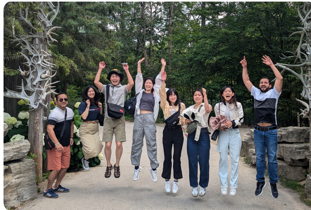
Students jump under the antler arch at the NEW Zoo!